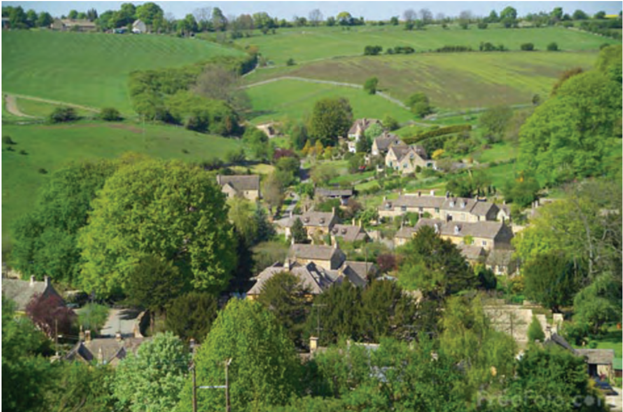
Figure 2: A rural settlement